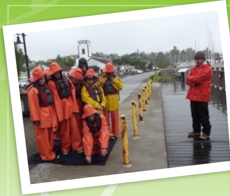
U.S. Coast Guard approved safety gear and U. S. Coast Guard certified staff.